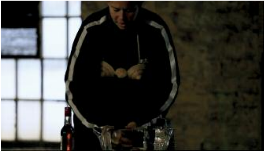
Recipe for Planters Punch, 2016 Performance still