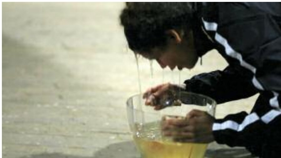
Recipe for Planters Punch, 2016 Performance still