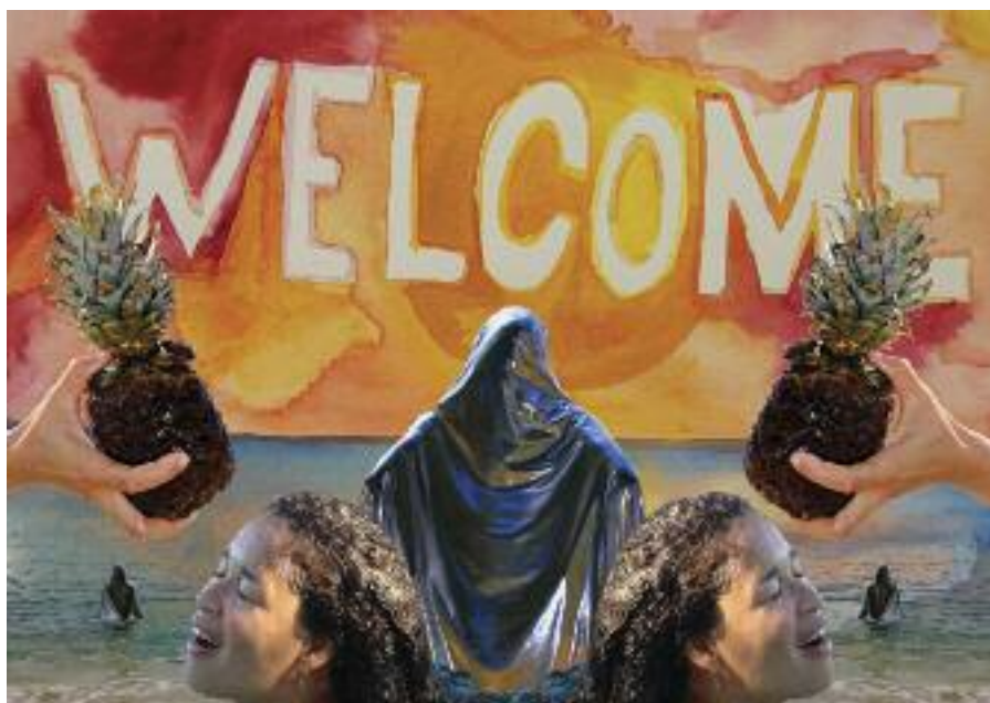
Studies of Welcome I, 2016