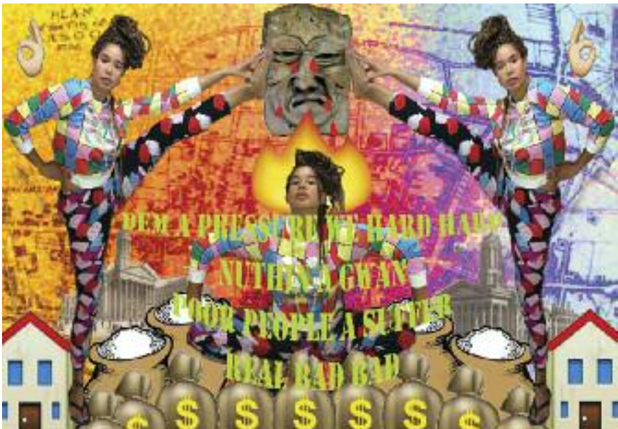
Dem A Pressure We Hard Hard Hard, 2015 Digital collage, 841mm x 1189mm