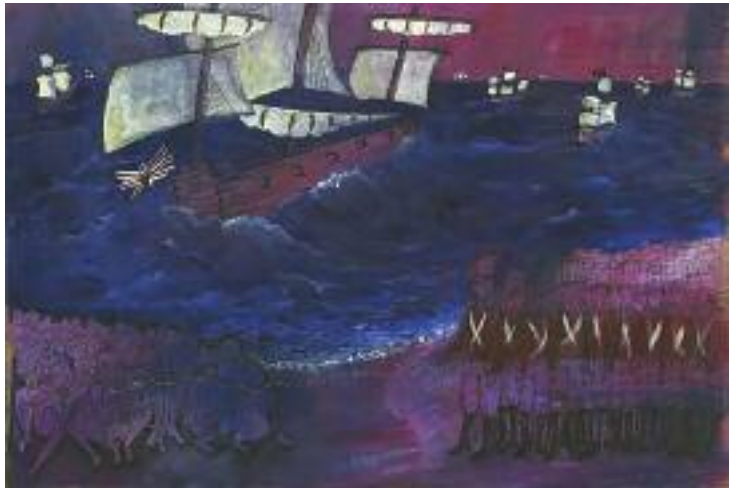
Long Journey , 2012 Acrylic on paper (29.7 cm x 42 cm)