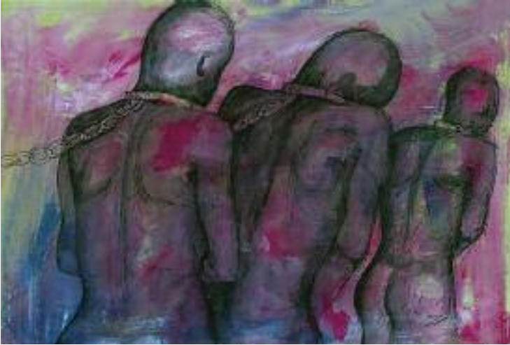
Life in Chains , 2012 Acrylic on paper (29.7 cm x 42 cm)