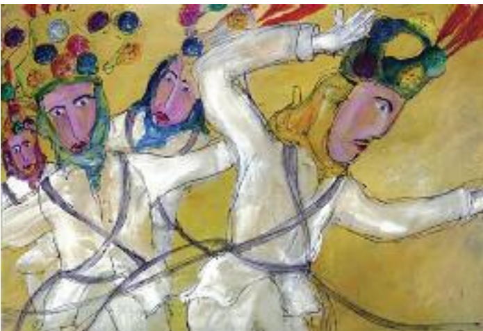
Rhythm of the Wanaragua , 2012 Acrylic on paper (29.7 cm x 42 cm)