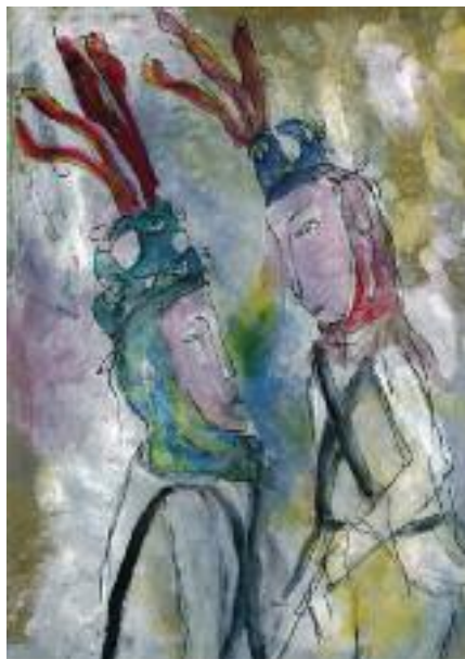
The Dance , 2012 Acrylic on paper (29.7 cm x 42 cm)