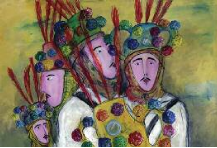
New Beginning , 2012 Acrylic on paper (29.7 cm x 42 cm)