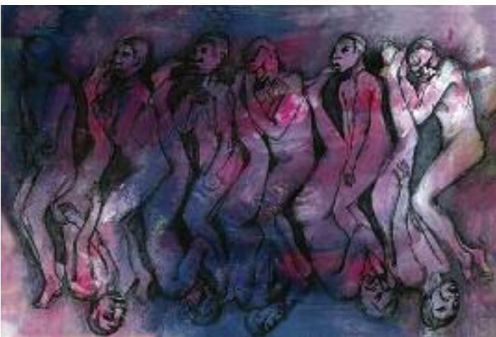
Am I? , 2012 Acrylic on paper (29.7 cm x 42 cm)