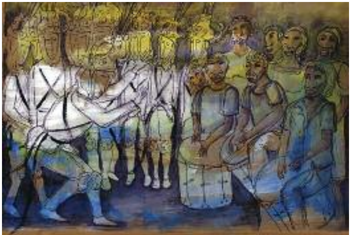
The Wanaragua – A Traditional Dance , 2012 Acrylic on paper (29.7 cm x 42 cm)