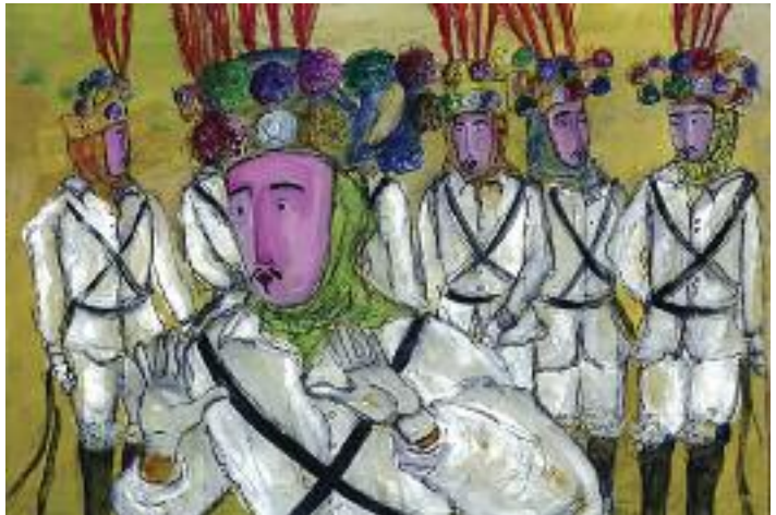
Cultural Journey , 2012 Acrylic on paper (29.7 cm x 42 cm)