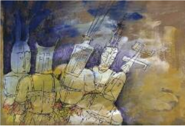
African Traditions , 2012 Acrylic on paper (29.7 cm x 42 cm)