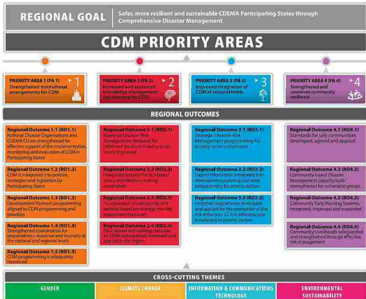
FIGURE 1: ILLUSTRATES THE LOGIC MODEL INCLUSIVE OF THE PURPOSE STATEMENTS AND CROSS-CUTTING THEMES