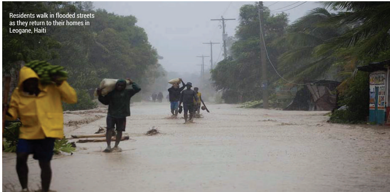
Residents walk in flooded streets as they return to their homes in Leogane, Haiti

Research shows that men and women are affected by and respond to disasters in different ways. They have distinct coping strategies in response to the stress associated with a hurricane or other natural hazard. Based on the explanation of gender and gender roles in Module 1 it is clear that women and men have practical and strategic needs.