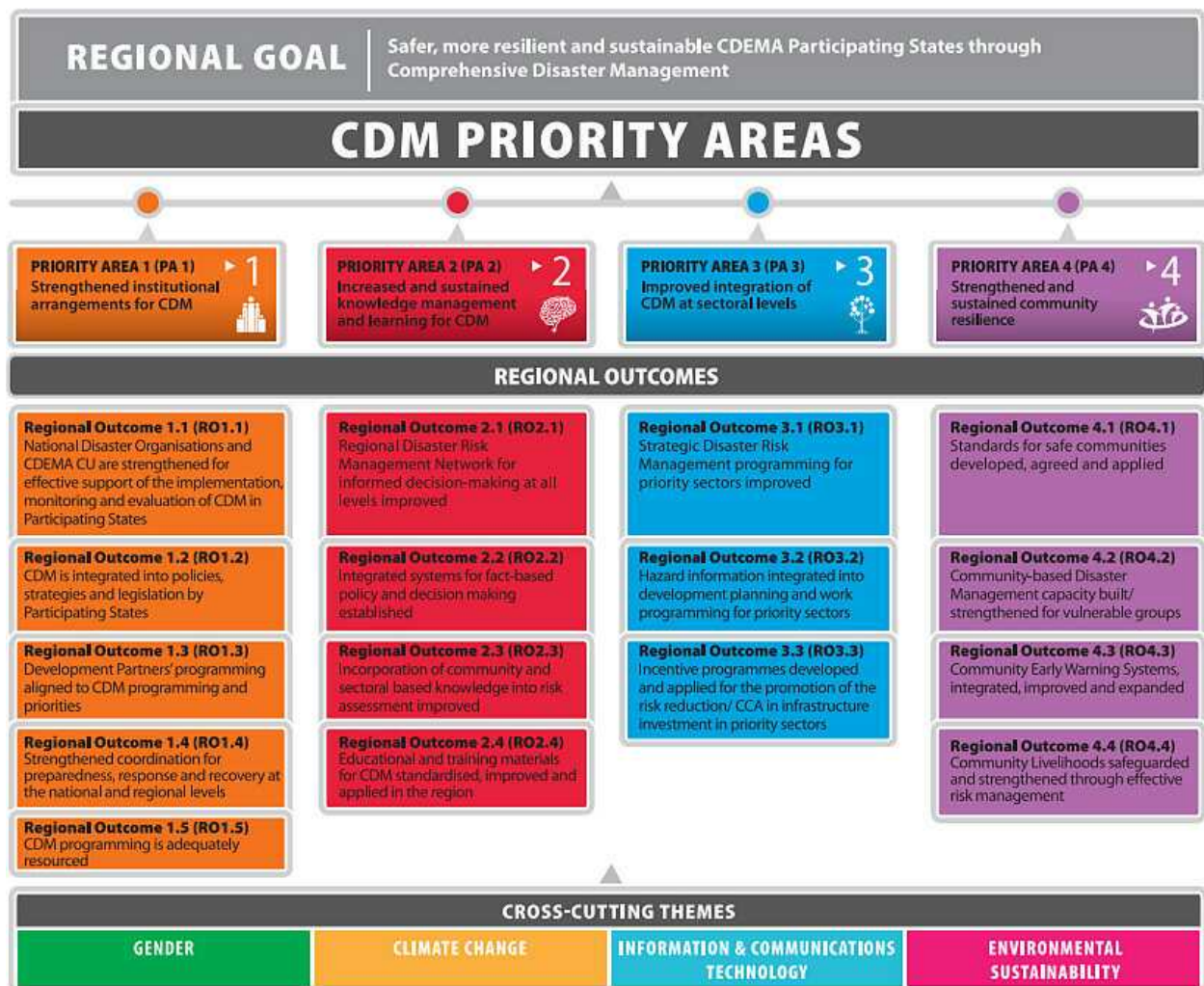
FIGURE 1: ILLUSTRATES THE LOGIC MODEL INCLUSIVE OF THE PURPOSE STATEMENTS AND CROSS-CUTTING THEMES

The global and regional commitments to integrate gender as a cross-cutting theme in the Comprehensive Disaster Management Framework 2014-2024 are reflected in Figure 1 below. The Framework represents the regional commitment to use CDM to achieve safer, more resilient and sustainable development in CDEMA participating member states. A summary of the Regional Comprehensive Disaster Management Strategy and Results Framework 2014- 2024 is available at http://www.cdema.org/cdema_strategy_summary.pdf .