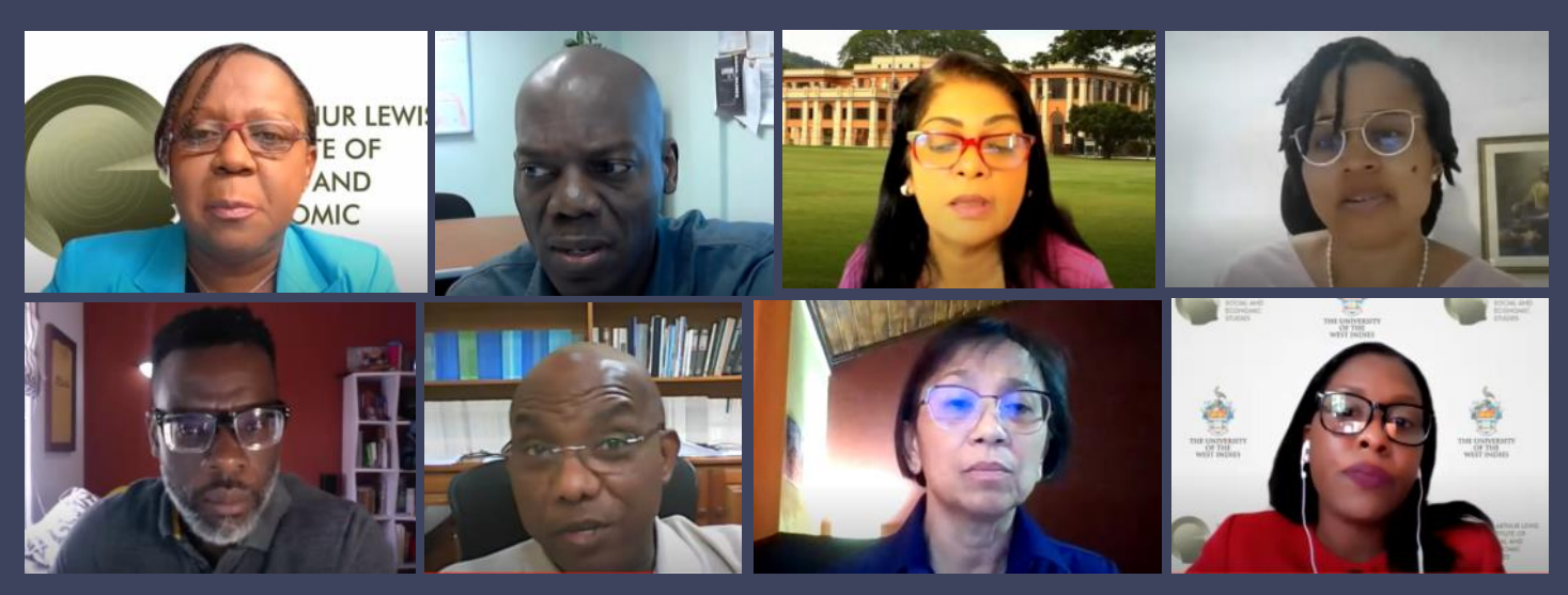
Snapshots from the Research for Development online forum