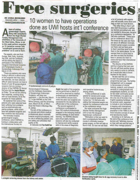
Feature on the Free Surgeries done on March 21 2017 in the Sunday Observer