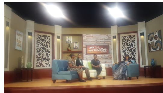
Two of the ladies (left) who benefited from the free surgery in March 2017 appeared on the Susan show